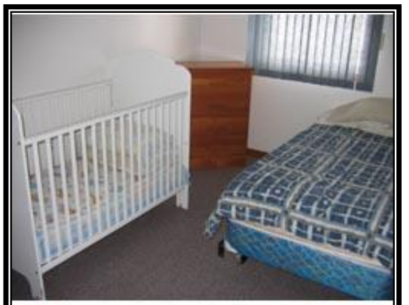
A crib for the baby, a bed for an older child.