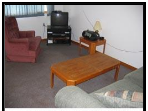
Each PFV has a TV and radio in the living room.