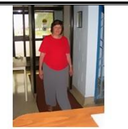
Walking through the metal detector All visitors, as in airport security, walk through a metal detector.