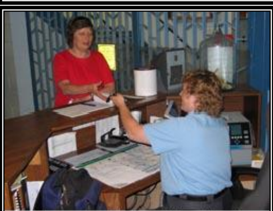
and have two pieces of identification, including I.D. with a photo, when signing in.