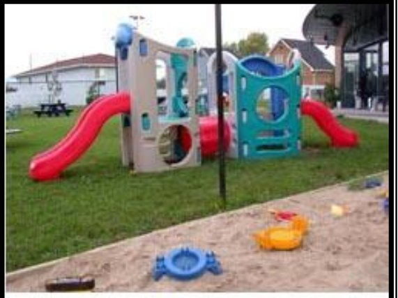
Some institutions have an outside visiting and play area.

Toys and games help to normalize a family relationship during a visit.