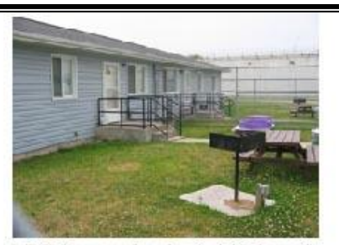
PFV's may be denied if there is violence in a past or current relationship, a negative community assessment, or security issues related to drugs or contraband.