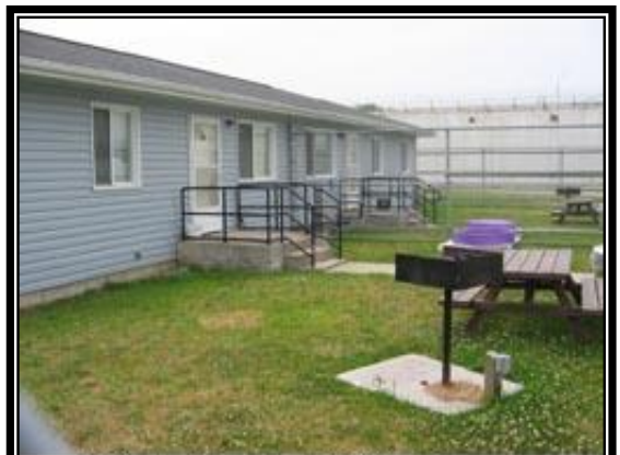
Private Family Visiting Program. Eligible families have 72-hour PFV's every 3-6 months.