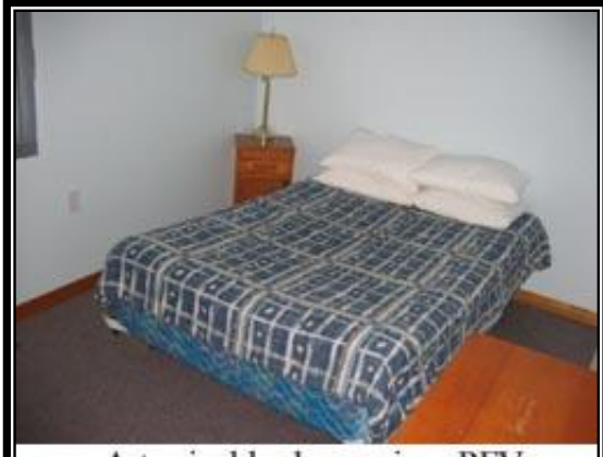
A typical bedroom in a PFV.