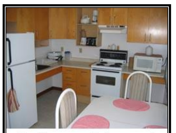
Families prepare their own meals in the PFV kitchen.