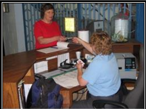
Signing in at Visitor Security Control. Visitors must complete a Visiting Application Form prior to visiting ...