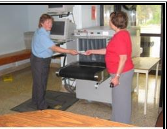
Some items are swabbed and tested for drugs using the Ion Scanner. Drug dogs may also be used.