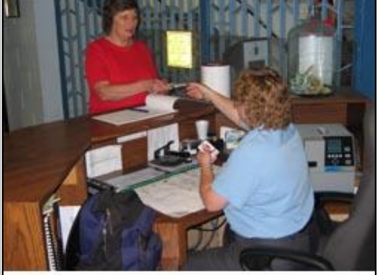
Signing in at Visitor Security Control. Visitors must complete a Visiting Application Form prior to visiting ...