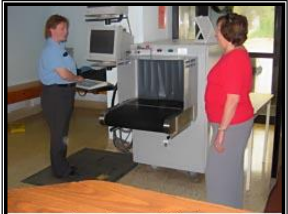
Searches and Visitors. Personal items are scanned through an X-ray machine.