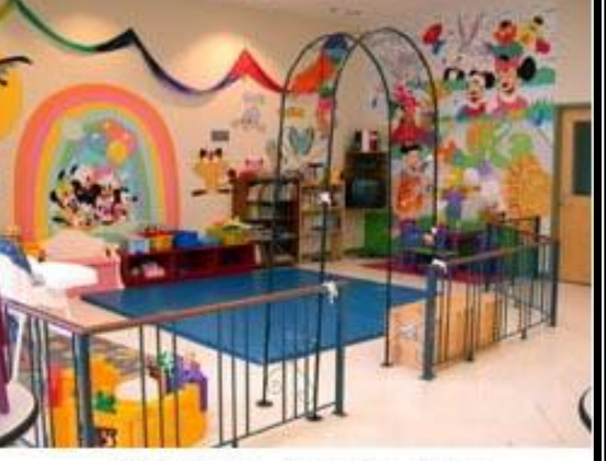
Children's Activity Area. Some activity areas have a TV and VCR.

Visitors may be under audio and video surveillance.