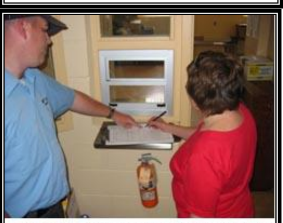
Many institutions require visitors to reserve a visiting time prior to the visit, by phone or in person.