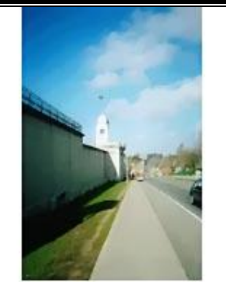
What is it like to visit a family member or friend in a federal correctional institution?

Not all institutions look the same, but this will give you a glimpse of what it is like to visit: