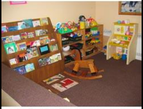
Playing together helps strengthen family ties and parent-child bonds.

Visitors can bring change to purchase coffee and food from the vending machines.