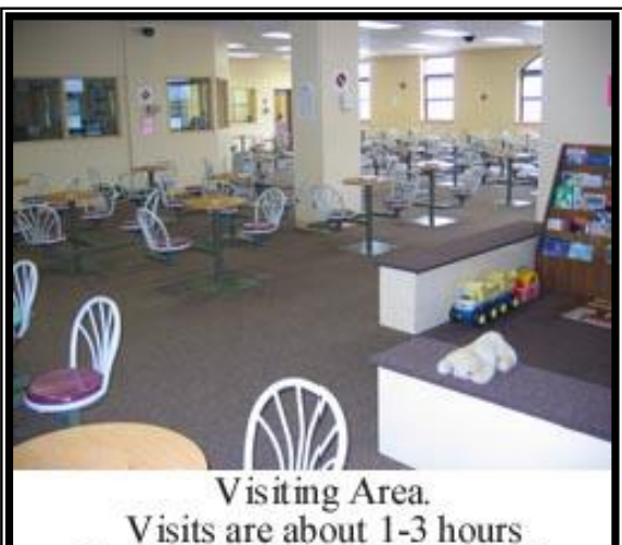
Visits are about 1-3 hours long, usually 3 times per week.

The interview can lead to closed visits, loss of visits or criminal charges. Drugs in an institution puts everyone's safety at risk. One person or parent in prison is already one too many.